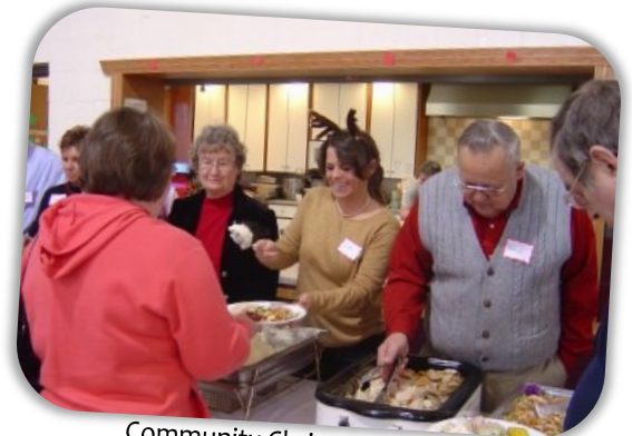
Community Christmas Dinner

The Shack is a missional community serving on the Lac Courte Oreilles Reservation. They are a mission under the WI District of the Wesleyan Church and are partnered locally with Hayward Wesleyan Church. It is their heartbeat to share, show, and shine the love and hope found in Jesus with the people of Odaawaa-Zaaga'iganiing.