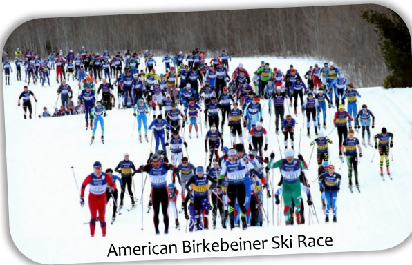
American Birkebeiner Ski Race

Hayward Wesleyan has partnered with Veterans groups in town to host programs and dinners to honor our service men and women.