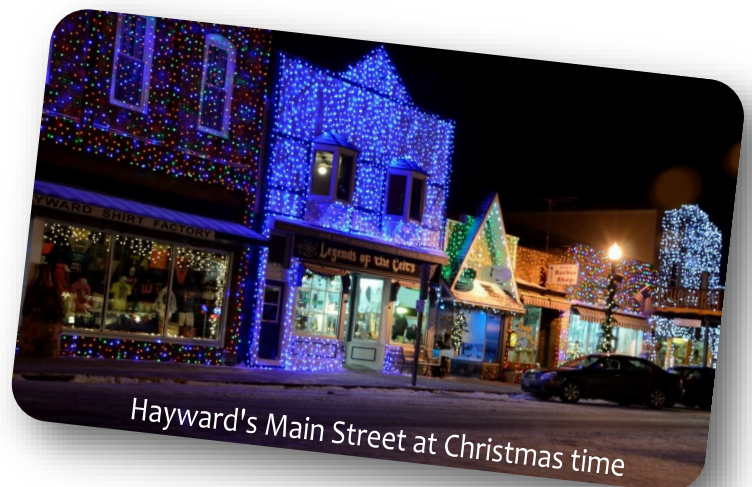
Hayward's Main Street at Christmas time

The Hayward Lakes Area surrounds the City of Hayward. This vibrant community has strong academic and sports programs, state-of-the-art education and medical facilities, a wealth of family resources, and a growing business community. The area is well-known for resorts and tourism, fishing, hunting, cross-country skiing and snowmobiling, along with a variety of other outdoor sports and recreation. Hayward is located 71 miles southeast of Superior, 140 miles northeast of Minneapolis, and 107 miles north of Eau Claire.