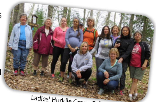
Ladies' Huddle Group Fall 2016

Small Group leaders are given training, support and encouragement in several gatherings throughout the year.