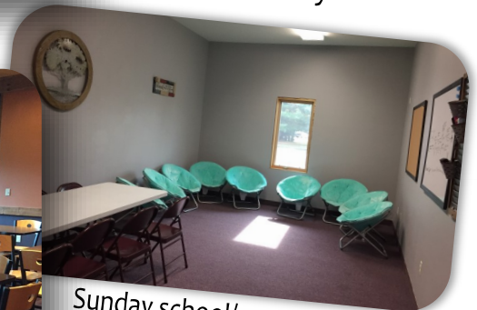
Sunday school/youth room