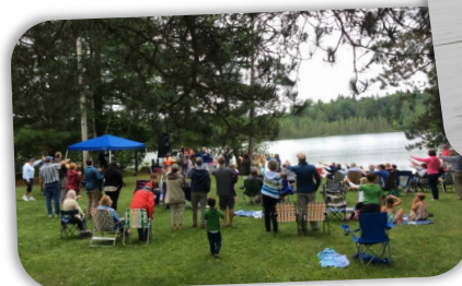
Church Picnic 2017

Therefore, if anyone is in Christ, the new creation has come. The old has gone, the new is here! - 2 Corinthians 5:17