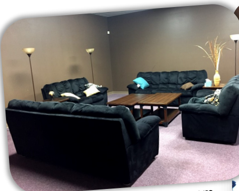
Youth group/small group room