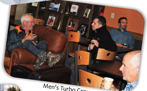
Men's Turbo Group

Other Men's Events: Crosswalk, Retreats, No Regrets Conference, and more!