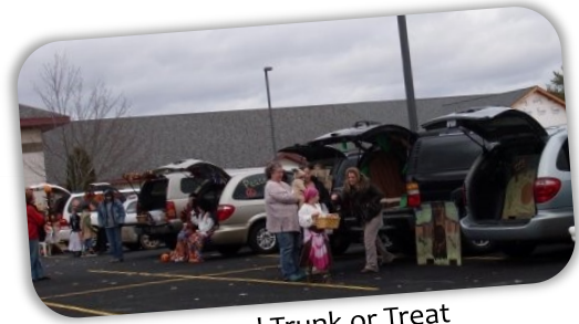
Annual Trunk or Treat

Annual church events that have encouraged community participation among kids and families include the Easter Eggstravaganza, Trunk Or Treat, and Vacation Bible School . Our annual Indoor Garage Sale brings many people through our doors, also.