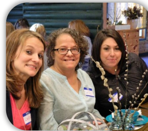
Above: Spring Retreat Right: Winter Warm Up

Twice a year there is a special event for the ladies, whether it be a "Winter Warm-up" or a Ladies' Tea. Usually once a year there is a ladies' retreat, either locally or as a Wesleyan district.